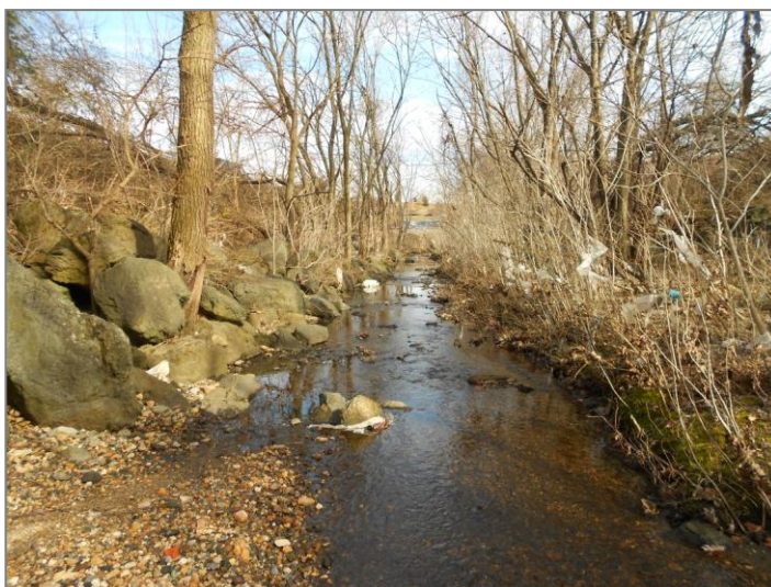
Waters of the US in West segment

Effects to waters of the US, including wetlands would only occur within the West segment, Cooks Lane Tunnel segment and East segment. Photo below shows one waters of the US system in the West segment. The majority of the waterway effects would occur where existing roads would be reconfigured or expanded to accommodate the Preferred Alternative, particularly in the West segment where these roads would cross or closely parallel Dead Run and its tributary drainages. There are no effects to tidal waterways, as the only tidal resource crossed by the project study corridor is the Jones Falls, and this would be crossed by the Downtown Tunnel segment, well below the stream bottom.