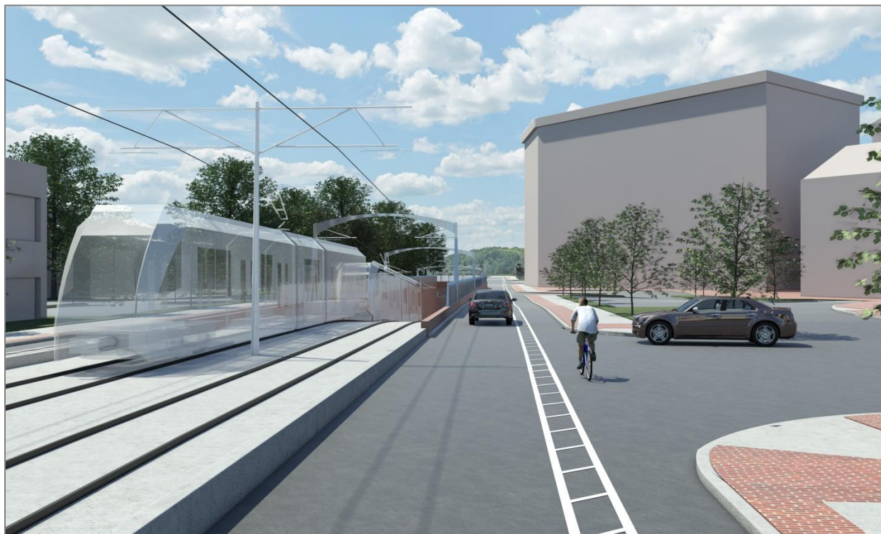
Figure ES-4: Rendering of Tunnel Portal on Boston Street