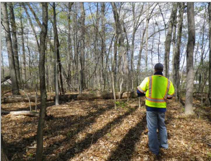
Typical forest stand within project study corridor

The Preferred Alternative would result in 34.8 acres of forest effect and the removal of 39 specimen trees. The majority of the long-term forest effects would occur within the West and Cooks Lane Tunnel segments (28.5 acres) in the western reaches of the project study corridor, where most of the resources exist (see photo below). Short-term forest/hedgerow effects would be limited since temporary staging and stockpile areas during construction would be sited primarily in non-forested areas, or within forests to be permanently affected. Staging and stockpiling areas located within forests would be replanted whenever possible following construction.