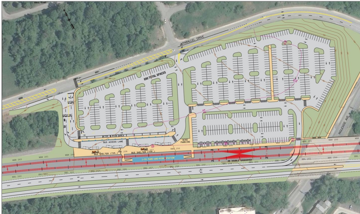
Figure ES-3: I-70 Park-and-Ride Concept

The Preferred Alternative has 19 stations: 14 surface and five underground. There are five park-and-ride facilities proposed for the Preferred Alternative, all of which would be surface parking lots. Two of the five park-and-ride lots would be constructed by separate initiatives (West Baltimore MARC and Bayview MARC) but passengers would be able to park at these facilities and ride the Red Line or the MARC. Figure ES-3 depicts the concept plan for the I-70 Park-and-Ride.