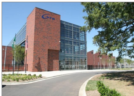
Maintenance Facility in a historic industrial neighborhood in Charlotte, North Carolina