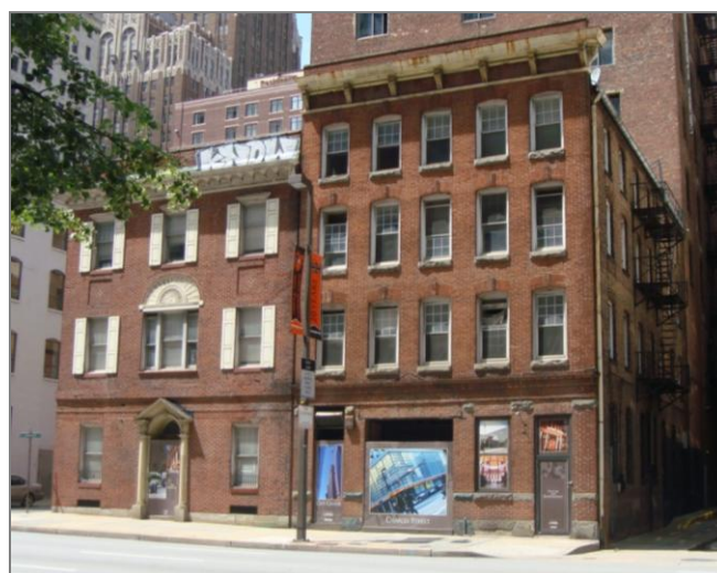
Proposed Section 4(f) permanent use of two contributing properties within the Business and Government Historic District

In accordance with Section 106 of the National Historic Preservation Act, as amended, and its implementing regulations at 36 CFR Part 800, the undertaking would result in an “adverse effect” to the Business and Government Historic District, so a finding of de minimis impact cannot be made. Therefore, an avoidance alternative evaluation and least overall harm analysis for the properties was conducted and is included the Draft Section 4(f) Evaluation ( FEIS Chapter 6 ). A final analysis and conclusion would be included in the Final Section 4(f) Evaluation, based on the views of the official with jurisdiction, Section 106 consulting parties, and comments on the Draft Section 4(f) Evaluation. The Final Section 4(f) Evaluation will be completed and included as part of the ROD.