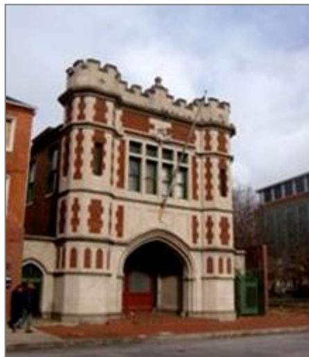
Poppleton Fire Station (Engine House No. 38)

Therefore, an overall finding of adverse effect on historic properties has been proposed for the Preferred Alternative. The historic properties that have proposed adverse effects by the Preferred Alternative are located within Baltimore City. The proposed findings have been submitted to the Maryland Historic Trust (MHT) and consulting parties for their review.