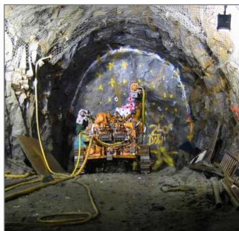
Example of drilling and blasting process

To enable construction of the underground segments of the project, several different tunneling construction methods for different portions of the tunnel are being considered, including excavation of the running tunnels by TBMs, cut-and-cover excavation for underground stations and tunnel portals, as well as some drilling and blasting at certain areas. The photo identifies an example of the drilling and blasting process.