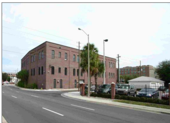
Maintenance Facility in Tampa, Florida

The Operations and Maintenance Facility (OMF), as proposed, would be comprised of 11 parcels, consisting of a total of 20.8 acres, in Baltimore City along the south side of US 40/Franklin Street centered on Calverton Road between Franklinton Road and Warwick Avenue, and referred to as the Calverton Road site. The OMF is where light rail cars would be stored, maintained, and dispatched each day on their daily routes. The facility would accommodate administrative functions and light rail operation functions for the Preferred Alternative. Example operations and maintenance facilities are shown in the photos below.