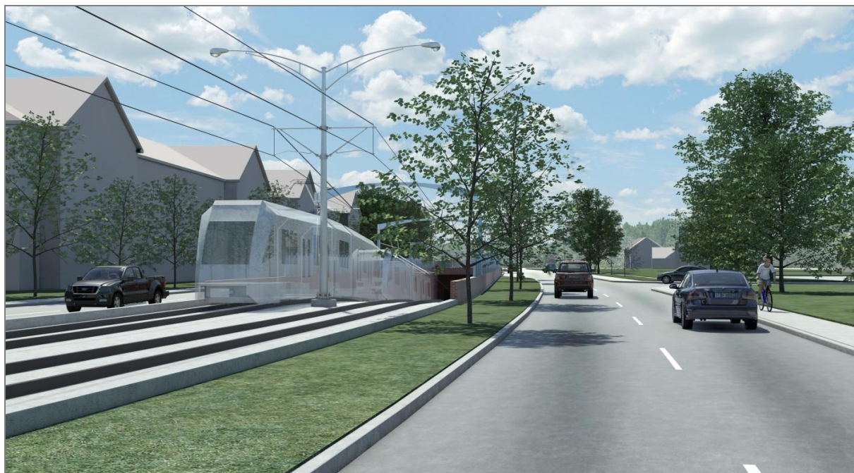
Figure ES-2: Rendering of Tunnel Portal of Edmondson Avenue

The Red Line would enter the Downtown Tunnel alignment within the median of US 40 immediately west of North Schroeder Street bridge and continue in a tunnel alignment underneath Fremont Avenue, Lombard Street, President Street, Fleet Street and Boston Street for approximately 3.4 miles to a tunnel portal in the median of Boston Street east of the intersection with Montford Avenue/Hudson Street. The Red Line would continue the remainder of the 3.2 miles of the project along the median of Boston Street; transitioning on new right-of-way to the west side of Haven Street continuing north across Haven Street into Norfolk Southern (NS) railroad right-of-way; continuing north over Eastern Avenue ascending and turning east onto a new aerial structure over the NS railroad, CSX railroad, and local city streets to the Johns Hopkins Bayview Medical Center campus; traversing the campus on a future Cassell Drive, Alpha Commons Boulevard, and Bayview Boulevard; the alignment continues north and east adjacent to I-895 terminating at the Bayview MARC Station.