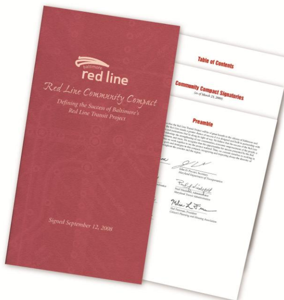
Red Line Community Compact

The MTA has begun work on an initiative that would lead to future employment and training opportunities for local area residents as well as expanded opportunities for local disadvantaged businesses. The initiative will outline a policy and identify potential programs to "put Baltimore to work on the Red Line" as summarized in the Baltimore City Red Line Community Compact (see right). The Compact is available on the project website. The MTA anticipates having a policy and program in place before construction contracts are advertised ( Economic Activity Technical Memorandum, 2012 ).