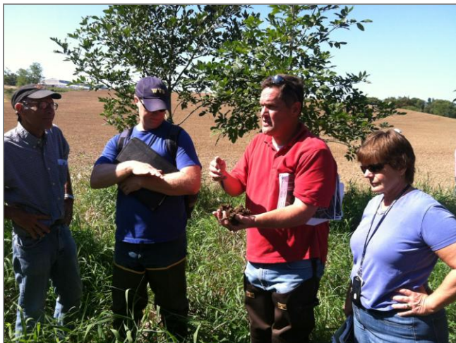
Compensatory mitigation field review

After completion of desktop site identification and ranking and on-site field investigations, the most viable sites were presented to agency representatives (see photo below). The potential mitigation sites presented in the Phase I Conceptual Mitigation Plan total 19.91 acres of